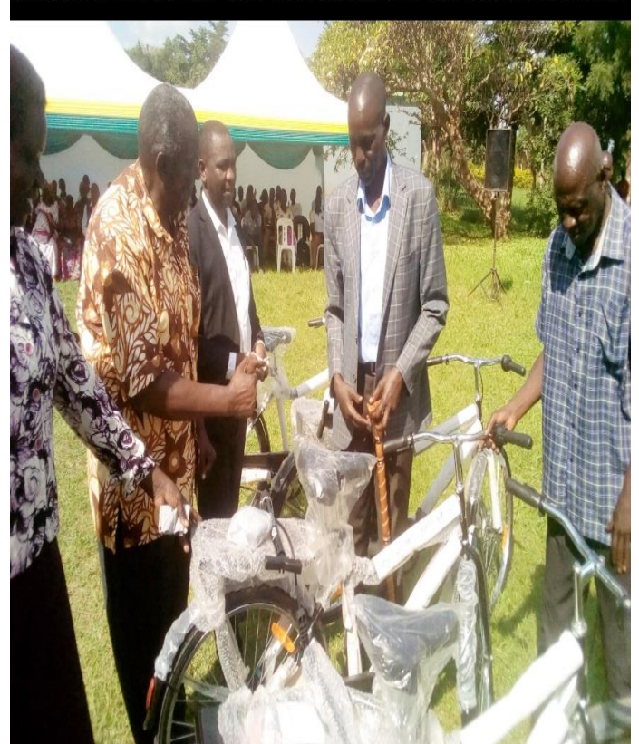
SOROTI DISTRICT HEALTH TEAM RECEIVING BICYCLES