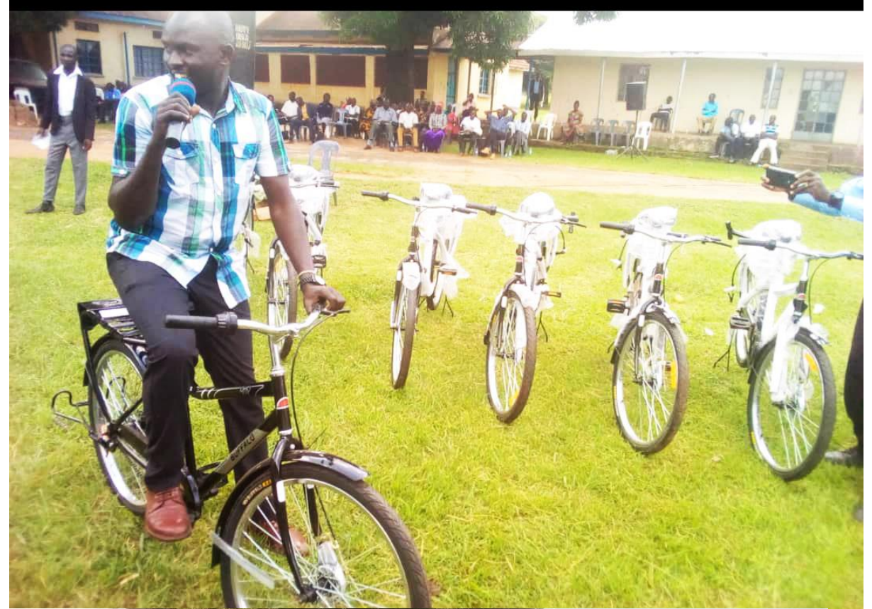
DHO AND LCV SOROTI DISTRICTING RECEIVING BICYCLES